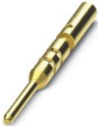
Crimp contact, turned, contact diameter: 0.8 mm, crimp range: 0.34 mm 2 ... 0.5 mm 2

Please be informed that the data shown in this PDF Document is generated from our Online Catalog. Please find the complete data in the user's documentation. Our General Terms of Use for Downloads are valid ( http://phoenixcontact.com/download )