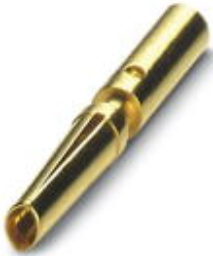
Crimp contact, turned, contact diameter: 0.8 mm, crimp range: 0.34 mm 2 ... 0.5 mm 2

Please be informed that the data shown in this PDF Document is generated from our Online Catalog. Please find the complete data in the user's documentation. Our General Terms of Use for Downloads are valid ( http://phoenixcontact.com/download )