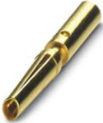
Crimp contact, turned, contact diameter: 0.8 mm, crimp range: 0.08 mm 2 ... 0.25 mm 2

Please be informed that the data shown in this PDF Document is generated from our Online Catalog. Please find the complete data in the user's documentation. Our General Terms of Use for Downloads are valid ( http://phoenixcontact.com/download )