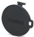
Protective cap for 3 and 5-pos. PRC field plugs