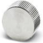
Metal protection cap for signal connectors with M23 external thread

Metal protective cap - RC-Z2104 - 1604260