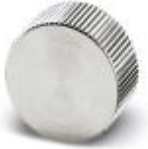
Metal protection cap for signal connectors with M23 external thread

Metal protective cap - RC-Z2104 - 1604260