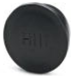
Plastic protection cap, antistatic, for connectors with M23 knurled nut

Plastic anti-static dust protection cap - RC-Z2468 - 1611796