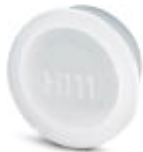
Plastic protection cap for connectors with M23 knurled nut

Plastic anti-static dust protection cap - RC-Z2468 - 1611796