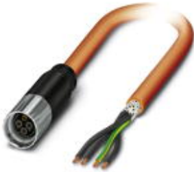
Cable plug in molded plastic, length: 5 m, color of outer sheath: orange RAL 2003

Please be informed that the data shown in this PDF Document is generated from our Online Catalog. Please find the complete data in the user's documentation. Our General Terms of Use for Downloads are valid ( http://phoenixcontact.com/download )