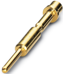
Crimp contact, turned, contact diameter: 1 mm, crimp range: 0.25 mm 2 ... 1 mm 2

Please be informed that the data shown in this PDF Document is generated from our Online Catalog. Please find the complete data in the user's documentation. Our General Terms of Use for Downloads are valid ( http://phoenixcontact.com/download )