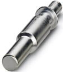
Crimp contact, turned, contact diameter: 10 mm, crimp range: 35 mm 2 ... 35 mm 2

Please be informed that the data shown in this PDF Document is generated from our Online Catalog. Please find the complete data in the user's documentation. Our General Terms of Use for Downloads are valid ( http://phoenixcontact.com/download )