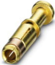
Crimp contact, turned, contact diameter: 2 mm, crimp range: 0.25 mm 2 ... 1 mm 2

Please be informed that the data shown in this PDF Document is generated from our Online Catalog. Please find the complete data in the user's documentation. Our General Terms of Use for Downloads are valid ( http://phoenixcontact.com/download )