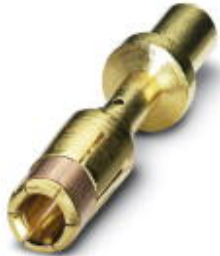
Crimp contact, turned, Single contact, contact diameter: 3.6 mm, crimp range: 2.5 mm 2 ... 4 mm 2

Please be informed that the data shown in this PDF Document is generated from our Online Catalog. Please find the complete data in the user's documentation. Our General Terms of Use for Downloads are valid ( http://phoenixcontact.com/download )