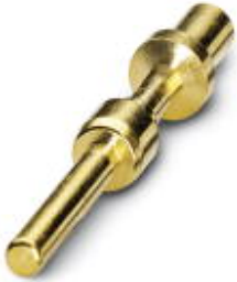
Crimp contact, turned, Single contact, contact diameter: 3.6 mm, crimp range: 6 mm 2 ... 10 mm 2

Please be informed that the data shown in this PDF Document is generated from our Online Catalog. Please find the complete data in the user's documentation. Our General Terms of Use for Downloads are valid ( http://phoenixcontact.com/download )