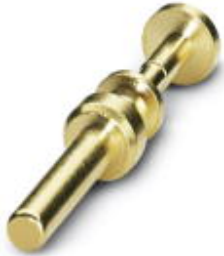
Crimp contact, turned, Single contact, contact diameter: 3.6 mm, crimp range: 6 mm 2 ... 10 mm 2

Please be informed that the data shown in this PDF Document is generated from our Online Catalog. Please find the complete data in the user's documentation. Our General Terms of Use for Downloads are valid ( http://phoenixcontact.com/download )