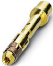
Crimp contact, turned, Single contact, contact diameter: 1 mm, crimp range: 0.5 mm 2 ... 1.5 mm 2

Please be informed that the data shown in this PDF Document is generated from our Online Catalog. Please find the complete data in the user's documentation. Our General Terms of Use for Downloads are valid ( http://phoenixcontact.com/download )