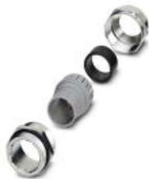
Brass screw connection, PG21

Please be informed that the data shown in this PDF Document is generated from our Online Catalog. Please find the complete data in the user's documentation. Our General Terms of Use for Downloads are valid ( http://phoenixcontact.com/download )