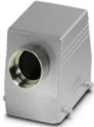
HEAVYCON sleeve housing D50, for double locking latch, height 76 mm, with support 1x M32, lateral conductor exit

Please be informed that the data shown in this PDF Document is generated from our Online Catalog. Please find the complete data in the user's documentation. Our General Terms of Use for Downloads are valid ( http://phoenixcontact.com/download )