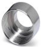
Step-up adapter, M32 to M40, including O-ring

Extension adapter - ENLAR-M-KV-M32/M40 - 1647682