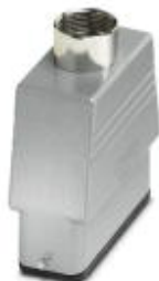
HEAVYCON sleeve housing D25, for single locking latch, height 72 mm, with support 1x M25, straight conductor exit

Please be informed that the data shown in this PDF Document is generated from our Online Catalog. Please find the complete data in the user's documentation. Our General Terms of Use for Downloads are valid ( http://phoenixcontact.com/download )