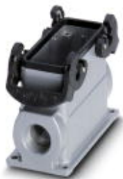
HEAVYCON box mounting base B16, with double locking latch, height 84 mm, with support 2xM32

Please be informed that the data shown in this PDF Document is generated from our Online Catalog. Please find the complete data in the user's documentation. Our General Terms of Use for Downloads are valid ( http://phoenixcontact.com/download )