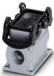
HEAVYCON box mounting base B10, with double locking latch, height 74 mm, with support 1xM32

Please be informed that the data shown in this PDF Document is generated from our Online Catalog. Please find the complete data in the user's documentation. Our General Terms of Use for Downloads are valid ( http://phoenixcontact.com/download )