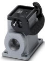
HEAVYCON box mounting base B6, with single locking latch. Height 52 mm, with supports 2xM20

Please be informed that the data shown in this PDF Document is generated from our Online Catalog. Please find the complete data in the user's documentation. Our General Terms of Use for Downloads are valid ( http://phoenixcontact.com/download )