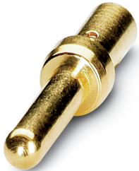
Crimp contact, turned, crimp range: 1 mm 2 ... 1.5 mm 2

Please be informed that the data shown in this PDF Document is generated from our Online Catalog. Please find the complete data in the user's documentation. Our General Terms of Use for Downloads are valid ( http://phoenixcontact.com/download )