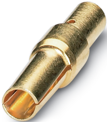
Crimp contact, turned, Single contact, contact diameter: 1 mm, crimp range: 0.5 mm 2 ... 1 mm 2

Please be informed that the data shown in this PDF Document is generated from our Online Catalog. Please find the complete data in the user's documentation. Our General Terms of Use for Downloads are valid ( http://phoenixcontact.com/download )