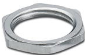
M20 x 1.5 locking nut

Please be informed that the data shown in this PDF Document is generated from our Online Catalog. Please find the complete data in the user's documentation. Our General Terms of Use for Downloads are valid ( http://phoenixcontact.com/download )