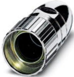
Sleeve housing for cable connector, straight, Screw locking, M23, shielded: no

Please be informed that the data shown in this PDF Document is generated from our Online Catalog. Please find the complete data in the user's documentation. Our General Terms of Use for Downloads are valid ( http://phoenixcontact.com/download )