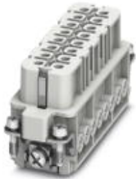
HEAVYCON female insert, A16 series, 16-pos., screw connection

Please be informed that the data shown in this PDF Document is generated from our Online Catalog. Please find the complete data in the user's documentation. Our General Terms of Use for Downloads are valid ( http://phoenixcontact.com/download )