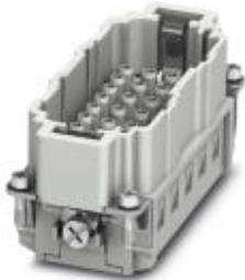
HEAVYCON pin insert, series: BB32, 32-pos., crimp connection, with plastic coding profile, can be coded

Please be informed that the data shown in this PDF Document is generated from our Online Catalog. Please find the complete data in the user's documentation. Our General Terms of Use for Downloads are valid ( http://phoenixcontact.com/download )