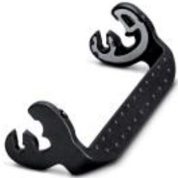
Replacement plastic single locking latch for standard housings of type B24

Please be informed that the data shown in this PDF Document is generated from our Online Catalog. Please find the complete data in the user's documentation. Our General Terms of Use for Downloads are valid ( http://phoenixcontact.com/download )