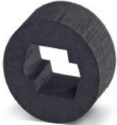
Seal for two AS-i lines, 17.2 x 9 mm, from NBR, black, for IP65/67 degree of protection

Please be informed that the data shown in this PDF Document is generated from our Online Catalog. Please find the complete data in the user's documentation. Our General Terms of Use for Downloads are valid ( http://phoenixcontact.com/download )