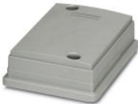
HEAVYCON ADVANCE B32 IP65 protective cover, for panel mounting side, screw locking with 2 Allen screws, with seal, 3 mm retaining cord eyelet

Please be informed that the data shown in this PDF Document is generated from our Online Catalog. Please find the complete data in the user's documentation. Our General Terms of Use for Downloads are valid ( http://phoenixcontact.com/download )