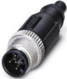
Terminating resistor CANopen®/DeviceNet™ M12

Please be informed that the data shown in this PDF Document is generated from our Online Catalog. Please find the complete data in the user's documentation. Our General Terms of Use for Downloads are valid ( http://phoenixcontact.com/download )