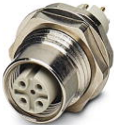
Sensor/Actuator flush-type socket, 4-pos., M12, A-coded, rear/screw mounting with Pg9 thread, with straight solder connection

Please be informed that the data shown in this PDF Document is generated from our Online Catalog. Please find the complete data in the user's documentation. Our General Terms of Use for Downloads are valid ( http://phoenixcontact.com/download )