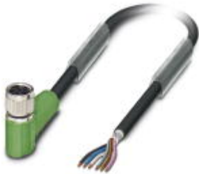
Sensor/actuator cable, 6-position, PUR halogen-free, black-gray RAL 7021, shielded, free cable end, on Socket angled M8, cable length: 5 m

Please be informed that the data shown in this PDF Document is generated from our Online Catalog. Please find the complete data in the user's documentation. Our General Terms of Use for Downloads are valid ( http://phoenixcontact.com/download )