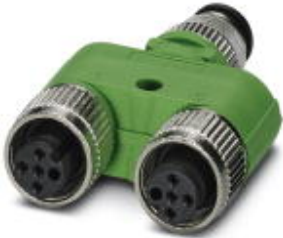
Y distributor, 5-position, unshielded, Plug straight M12, A-coded, on Socket straight M12, A-coded and Socket straight M12, A-coded, Parallel distributor

Please be informed that the data shown in this PDF Document is generated from our Online Catalog. Please find the complete data in the user's documentation. Our General Terms of Use for Downloads are valid ( http://phoenixcontact.com/download )