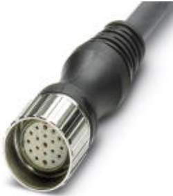
Socket M23, straight, 19-pos., with 20 m master cable

Please be informed that the data shown in this PDF Document is generated from our Online Catalog. Please find the complete data in the user's documentation. Our General Terms of Use for Downloads are valid ( http://download.phoenixcontact.com )