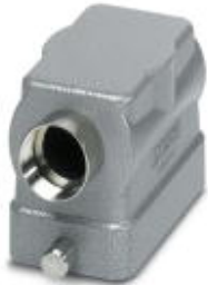
HEAVYCON B6 sleeve housing, for single locking latch, height: 56 mm, with 1 x Pg16 gland, lateral cable outlet

Please be informed that the data shown in this PDF Document is generated from our Online Catalog. Please find the complete data in the user's documentation. Our General Terms of Use for Downloads are valid ( http://phoenixcontact.com/download )