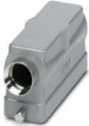
HEAVYCON B24 sleeve housing, for single locking latch, height: 65 mm, with 1 x M25 gland, lateral cable outlet

Please be informed that the data shown in this PDF Document is generated from our Online Catalog. Please find the complete data in the user's documentation. Our General Terms of Use for Downloads are valid ( http://phoenixcontact.com/download )