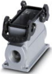
HEAVYCON B16 box mounting base, with double locking latch, height: 84 mm, with 1 x Pg29 gland

Please be informed that the data shown in this PDF Document is generated from our Online Catalog. Please find the complete data in the user's documentation. Our General Terms of Use for Downloads are valid ( http://phoenixcontact.com/download )