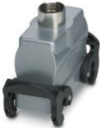
HEAVYCON B16 sleeve housing, with double locking latch, height: 56 mm, with 1 x M25 gland, straight cable outlet

Please be informed that the data shown in this PDF Document is generated from our Online Catalog. Please find the complete data in the user's documentation. Our General Terms of Use for Downloads are valid ( http://phoenixcontact.com/download )