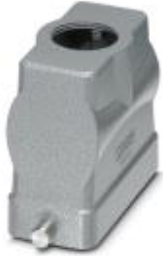
HEAVYCON B16 sleeve housing, for single locking latch, height: 76 mm, with 1 x M25 thread, straight cable outlet

Please be informed that the data shown in this PDF Document is generated from our Online Catalog. Please find the complete data in the user's documentation. Our General Terms of Use for Downloads are valid ( http://phoenixcontact.com/download )