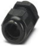
Cable gland - G-INS-M25-M68N-PNES-BK - 1411134

Cable gland, cable gland material: PA, external cable diameter 11 mm ... 17 mm, shielding: no, connecting thread: M25 x 1.5, color: jet black RAL 9005