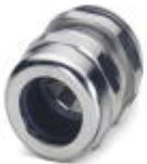
Cable gland - G-INSEC-M25-S68N-NCRS-S - 1411190

Cable gland, cable gland material: Nickel-plated brass, external cable diameter 11 mm ... 16 mm, shielding: yes, connecting thread: M25 x 1.5, color: silver, with O-ring