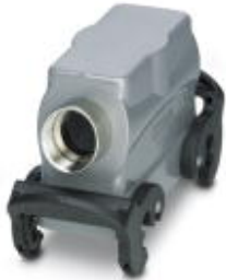
HEAVYCON B10 sleeve housing, with double locking latch, height 56 mm, with support 1 x M25, lateral cable outlet

Please be informed that the data shown in this PDF Document is generated from our Online Catalog. Please find the complete data in the user's documentation. Our General Terms of Use for Downloads are valid ( http://phoenixcontact.com/download )