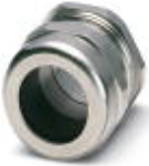
Cable gland - HC-M-KV-M25(14-21) - 1646007

Metal screw connection up to 5 bar, thread length: 7 mm, cable diameter: 14 - 21 mm, WAF 34, screw connection: M25