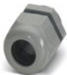
Cable gland, cable gland material: PA, external cable diameter 11 mm ... 17 mm, shielding: no, connecting thread: M25 x 1.5, color: silver-gray RAL 7001

Cable gland - G-INS-M25-M68N-PNES-GY - 1411126