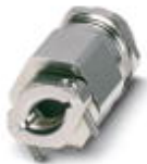
Cable gland - G-INESR-M25-M68N-NEPDS-S - 1415193

Cable gland, cable gland material: Nickel-plated brass, application: Standard, external cable diameter 9 mm ... 17 mm, shielding: no, connecting thread: M25 x 1.5, color: silver, with external strain relief, with O-ring