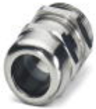
Cable gland - G-INS-M25-M68N-NNES-S - 1411165

Cable gland, cable gland material: Nickel-plated brass, external cable diameter 11 mm ... 17 mm, shielding: no, connecting thread: M25 x 1.5, color: silver, with O-ring