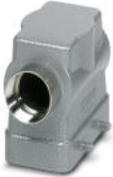
HEAVYCON B10 sleeve housing, for double locking latch, height: 72 mm, with 1 x Pg29 gland, lateral cable outlet

Please be informed that the data shown in this PDF Document is generated from our Online Catalog. Please find the complete data in the user's documentation. Our General Terms of Use for Downloads are valid ( http://phoenixcontact.com/download )