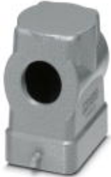
HEAVYCON B6 sleeve housing, for single locking latch, height: 72 mm, with 1 x M32 thread, lateral cable outlet

Please be informed that the data shown in this PDF Document is generated from our Online Catalog. Please find the complete data in the user's documentation. Our General Terms of Use for Downloads are valid ( http://phoenixcontact.com/download )