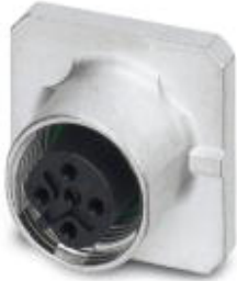
Sensor/actuator flush-type connector, 5-pos. socket, M12, B-coded, front/square flange mounting, wave soldering

Please be informed that the data shown in this PDF Document is generated from our Online Catalog. Please find the complete data in the user's documentation. Our General Terms of Use for Downloads are valid ( http://phoenixcontact.com/download )