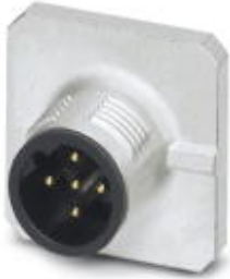
Sensor/actuator flush-type plug, 5-pos. socket, M12, B-coded, front/square flange mounting, wave soldering

Please be informed that the data shown in this PDF Document is generated from our Online Catalog. Please find the complete data in the user's documentation. Our General Terms of Use for Downloads are valid ( http://phoenixcontact.com/download )