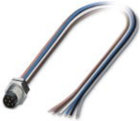
Sensor/actuator flush-type plug, 6-pos., M8, rear/screw mounting, with M8 thread, with 0.5 m TPE litz wire, 6 x 0.14 mm 2

Please be informed that the data shown in this PDF Document is generated from our Online Catalog. Please find the complete data in the user's documentation. Our General Terms of Use for Downloads are valid ( http://phoenixcontact.com/download )