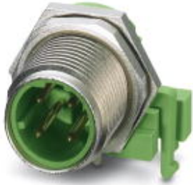
Bus system flush-type connector, Ethernet, 4-pos., M12, shielded, D-coded, rear/screw mounting, with angled solder connection

Please be informed that the data shown in this PDF Document is generated from our Online Catalog. Please find the complete data in the user's documentation. Our General Terms of Use for Downloads are valid ( http://phoenixcontact.com/download )