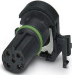
Sensor/actuator flush-type connector, socket, 5-pos., B-coded, shielded, with angled solder connection, only contact insert

Please be informed that the data shown in this PDF Document is generated from our Online Catalog. Please find the complete data in the user's documentation. Our General Terms of Use for Downloads are valid ( http://phoenixcontact.com/download )