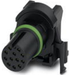
Sensor/actuator flush-type socket, 12-pos. without shroud, A-coded, with angled solder connection, contact insert only

Please be informed that the data shown in this PDF Document is generated from our Online Catalog. Please find the complete data in the user's documentation. Our General Terms of Use for Downloads are valid ( http://phoenixcontact.com/download )