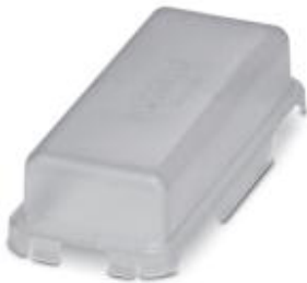
Protective covers, Design: B16, Degree of protection: IP20

Please be informed that the data shown in this PDF Document is generated from our Online Catalog. Please find the complete data in the user's documentation. Our General Terms of Use for Downloads are valid ( http://phoenixcontact.com/download )